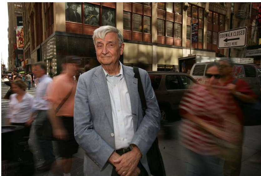
Dr. Wilson in Manhattan in 2008. While he had a lifelong obsession with ants, discovering how they communicate through pheromones, he is most famous for the publication in 1975 of “ Sociobiology: The New Synthesis ” which advanced evolutionary thinking.

“The lesson for man is that personal happiness has very little to do with all this,” he wrote. “It is possible to be unhappy and very adaptive.”