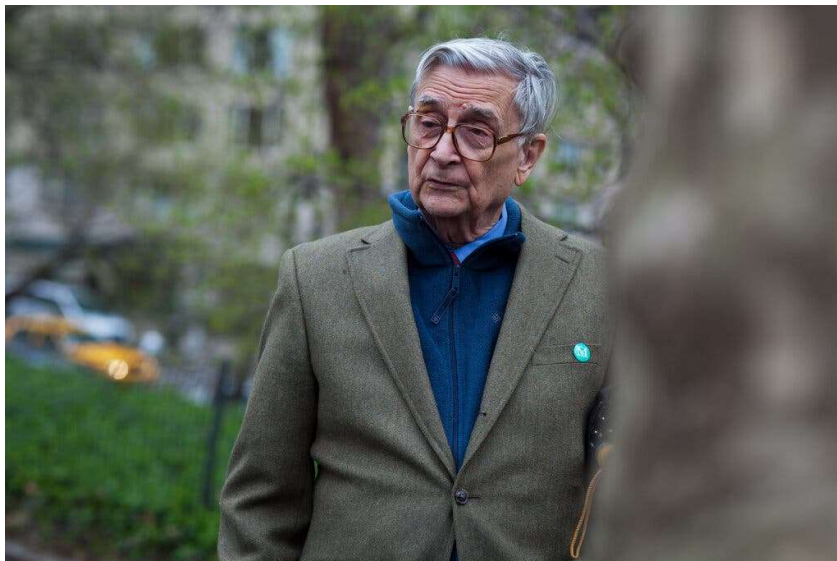
Even after retiring in 2002, Dr. Wilson, seen here in 2012, wrote more than a dozen books.