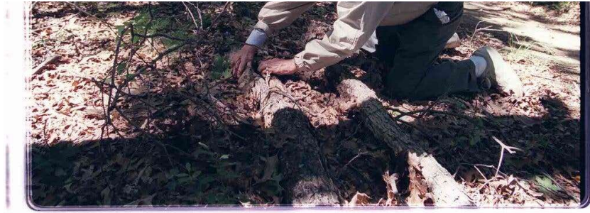
Dr. Wilson in the woods of Walden Pond Reservation in Concord, Mass., in 2002. He argued that leaving half the earth wild was the only way to avoid mass extinction.

To save biodiversity, Dr. Wilson called for a world of Gorongosas. In his 2016 book, “Half-Earth: Our Planet’s Fight for Life,” he argued that the only way to avoid a mass extinction would be to leave half the earth wild.